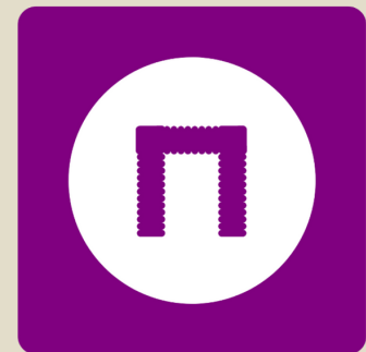
Purple Toko DIGITAL RETAIL REVOLUTION